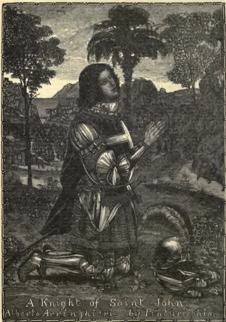
A Knight of Saint John, Alberto Arri nghieri. by Pinturicchio.